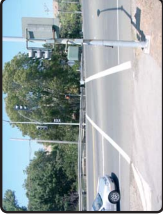
Looking northerly across Tiburon Boulevard