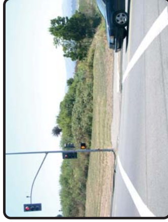
Looking southerly across Tiburon Boulevard