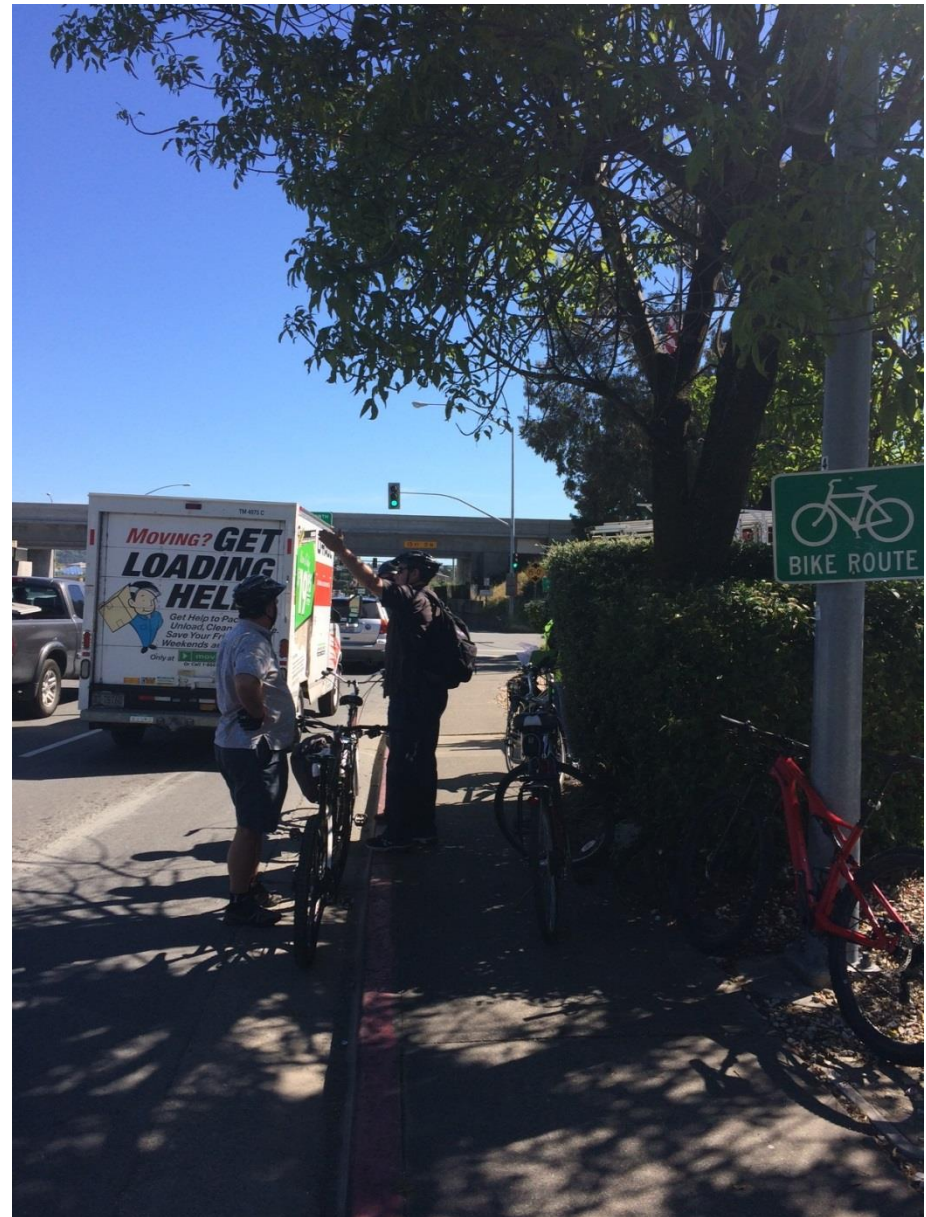
Bellam Blvd. & I-580 looking east. Narrow, obstructed sidewalks, no bicycle facility, heavy traffic, free right-hand turns onto freeway, undercrossing dark and narrow.

Disadvantaged Community Served? Yes, Canal