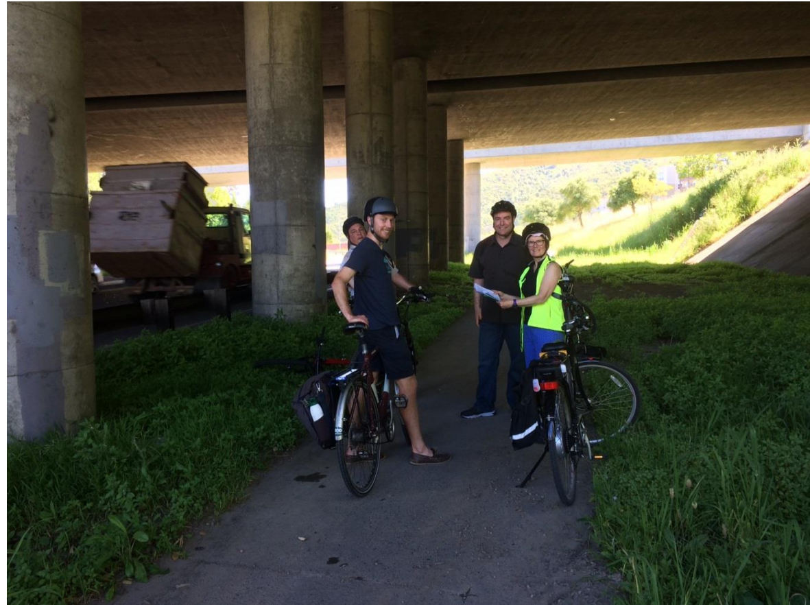
Hwy 101 Undercrossing at N. San Pedro Rd. Path exists, needs minimal work to upgrade to pleasant Class I facility. Challenges exist at Caltrans on/off ramps outside photo.

Part of Regional SF Bay Trail: Almost (directly connects to BT on Civic Cntr Dr., N. San Pedro) Feasibility Study Needed: Yes Disadvantaged Community Served? Yes (Canal students attend Venetia Valley School).