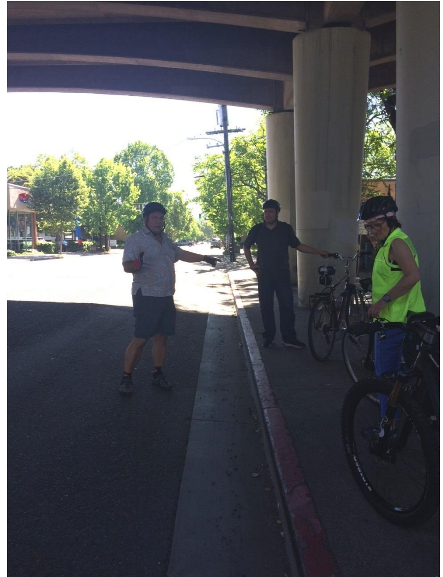
4 th St. San Rafael under Hwy 101 looking east. Dark, narrow, obstructed sidewalk, no bike lane or path.

Disadvantaged Community Served? Yes, Canal