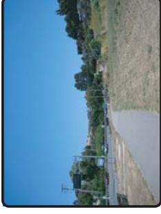
View of open field south Tiburon Blvd.