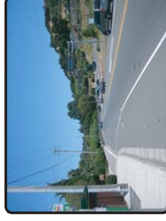
Intersection of Trestle Glen Blvd. and Tiburon Blvd. looking southeast