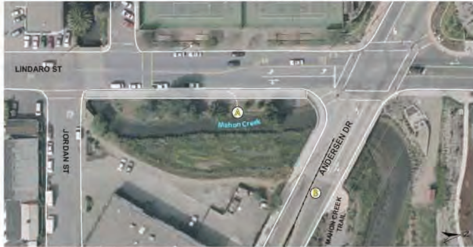
LINDARO ST: JORDAN STREET TO ANDERSEN DRIVE