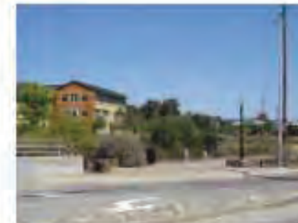
Entrance to Mahon Creek Trail starts midblock at Andersen Dr.