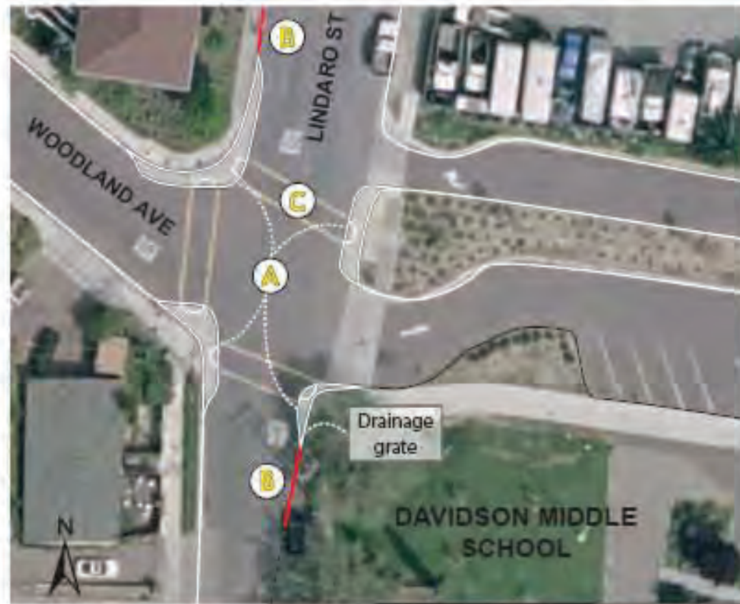
WOODLAND AVE AND LINDARO ST