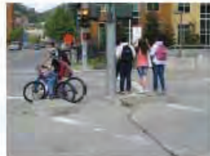
Andersen Dr. intersection.