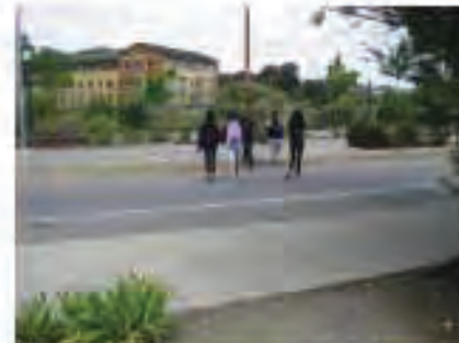
Students crossing midblock to access Mahon Creek Trail.