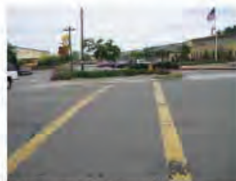
Crosswalk ends between school driveways.