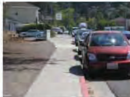
Narrow sidewalk beginning at Jordan St.