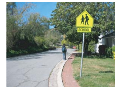
No sidewalk on north side of Jewell Avenue