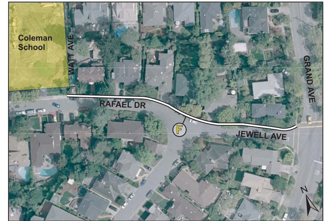
Jewell Avenue Improvements