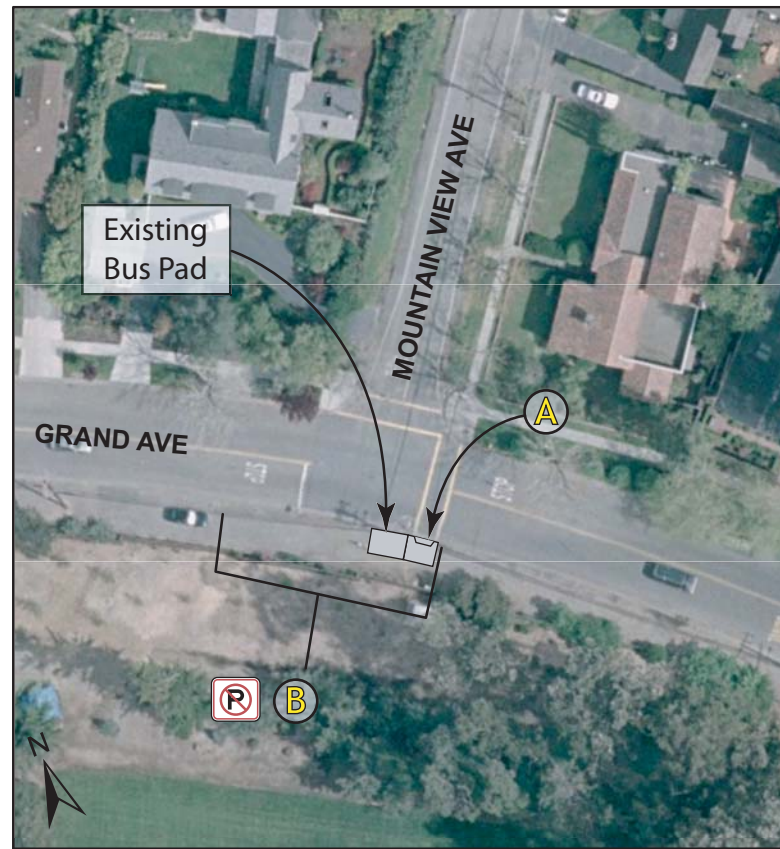
Grand Avenue and Mountainview Avenue Intersection Improvements