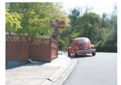
Fence on Jewell Ave.