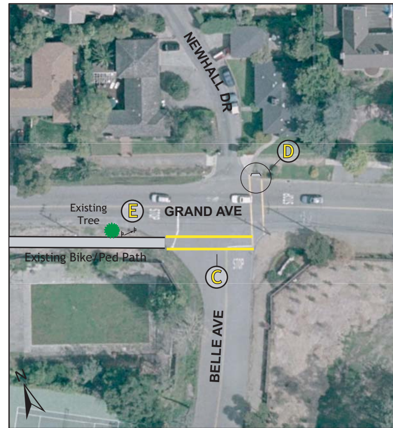
Grand Avenue/Belle Avenue Crossing Improvements