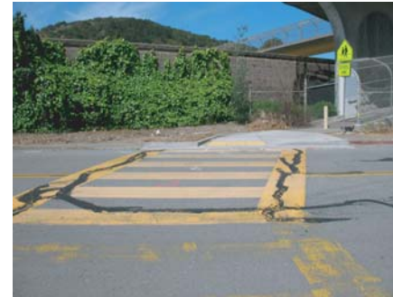
Crosswalk at school entrance to pedestrian over-crossing.