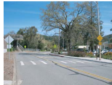
Approach to crosswalk at school entrance.